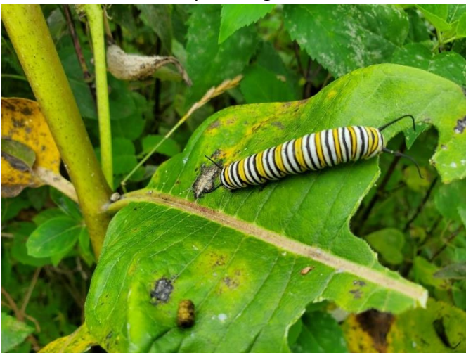
A monarch butterfly caterpillar munching on common milkweed.

The garden also features colorful butterfly ornaments, a pair of butterfly houses and an observation bench. Michaela S, shown here, installed this garden as her Eagle Scout Project, where it can serve as an educational resource for the park. We are very grateful for her efforts and those of all the scouts and volunteers whose work helped make this garden a reality. We are interested in continuing to increase the diversity of the Preserve with native plantings and invasives control.