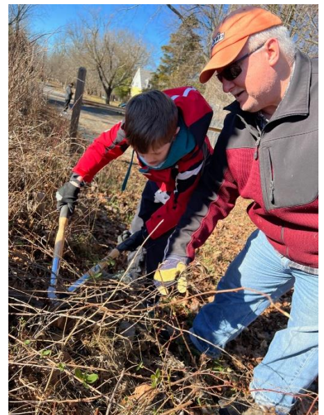
Clearing the ginkgo row.

March featured a TWILIGHT WALK to look and listen for signs of spring. Last year, we were fortunate to witness the woodcocks' spectacular mating ritual and hear spring peepers calling. This year, we were a little late for the woodcocks, but signs of coyote were everywhere.