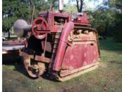
Custom-built equipment for digging up 10 ft tall bare root trees.