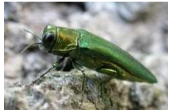
The Emerald Ash Borer

This invasive species from Asia has devastated tens of millions of ash trees in 24 states. The emerald ash borer beetle eats the leaves of ash trees, but it is the larva that really harm the tree. They tunnel through conductive tissue under the bark, causing die-back of the canopy and death of the tree. There are no treatment options; the only solution is tree removal. For more information and steps to take if you suspect infestation, please visit http://plant-pest-advisory.rutgers.edu/invasive-emerald-ash-borer-detected-in-new-jersey/