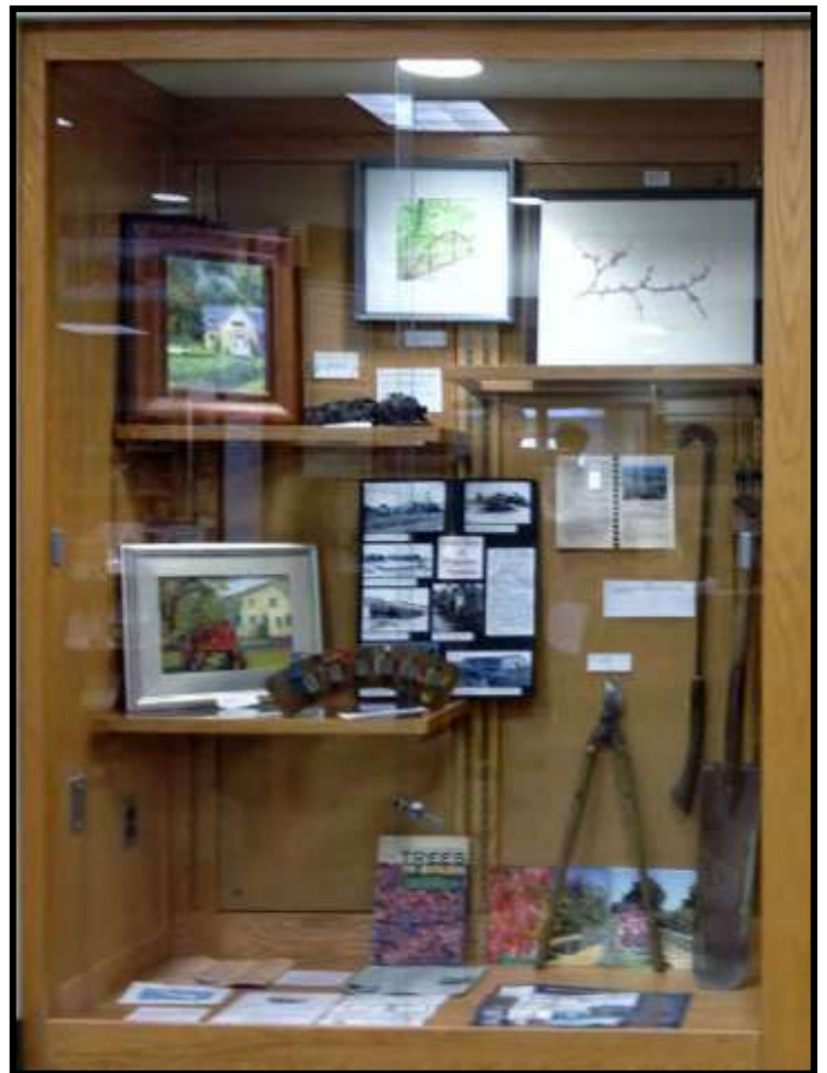
Part of the Princeton Nurseries Exhibit at Rocky Hill Library