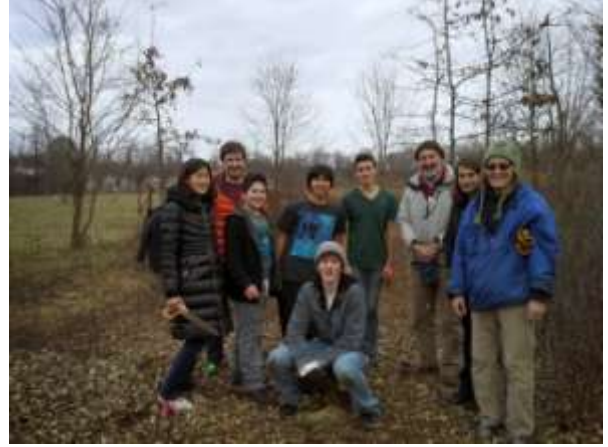
Students from Princeton Learning Cooperative take on autumn olive

Autumn Olive: This year, on both Martin Luther King Day and National Public Lands Day, our volunteers made good progress at reducing the amount of autumn olive in the fields of Mapleton Preserve. We express gratitude for all those who have helped us in this task, with a special shout-out to the students from the Princeton Learning Cooperative , who came back in June to see if our clearing efforts on Martin Luther King Day were successful and make sure that the cut stumps had not re-sprouted (they hadn't!)