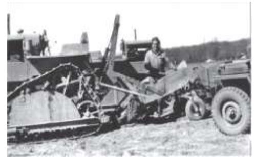
Machine modified by Princeton Nurseries for shrub digging