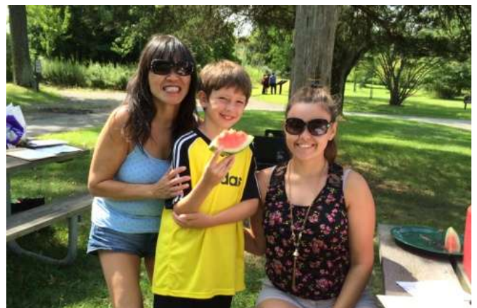
Enjoying watermelon after the Scavenger Hunt

Interesting finds included a praying mantis egg case, several cicadas and a wild turkey feather. It was a great way to get to know the Preserve and do a lot of learning in the process!