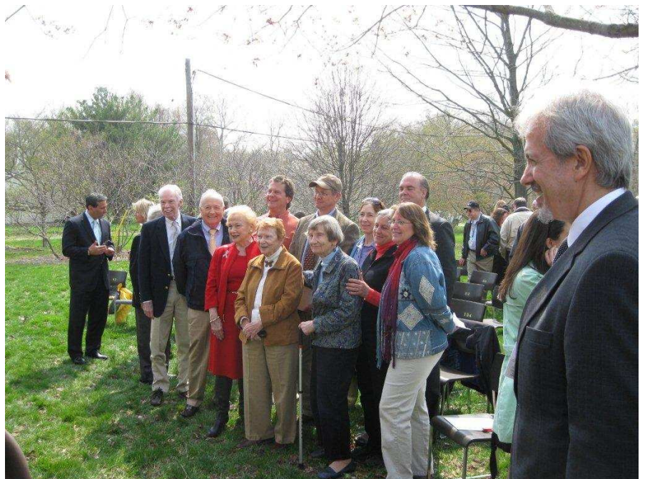
Members of the Flemer family and preservation partners at April 18 press conference announcing the preservation of Princeton Nurseries Allentown.

Friends of Princeton Nursery Lands thanks the Flemer family and all of the partners involved in this enormous preservation effort, as it assures that the scenic landscape that was once defined by Princeton Nurseries will keep its natural beauty and its agricultural character forever.