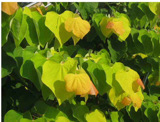
New leaves on 'The Rising Sun' Redbud ( Cercis canadensis) are apricot in color, maturing through chartreuse to a final deep green. Since all three color phases are present at once, the effect is spectacular.