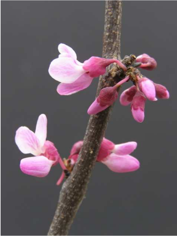
Close-up of redbud flowers. carrborocitizen.com/flora