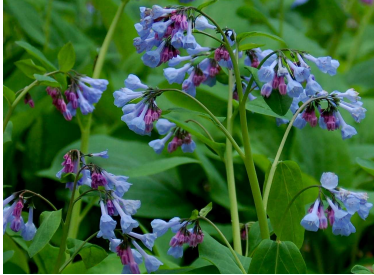
Virginia Bluebells

Wed. June 10<sup>th</sup>, 7:30 p.m. – FPNL Annual Meeting: Save the date! The speaker for our annual