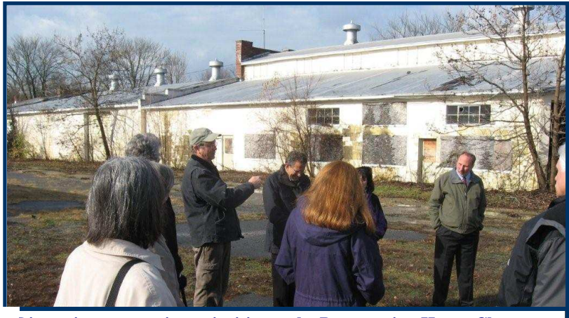
Discussing restoration priorities at the Propagation House Charrette

Propagation House Charrette: A preservation plan for the Propagation House is currently being prepared by Watson & Henry (preservation architects and engineers), to identify the issues, needs and