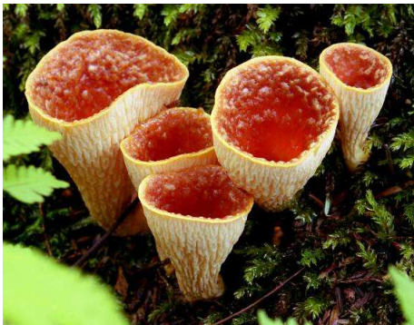
A beautiful Scaly Vase Chanterelle (Gomphus floccus)