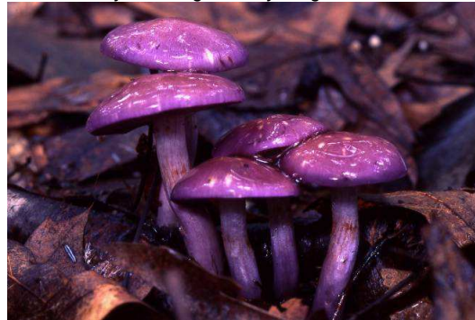
A common New Jersey mushroom the Violet Cort (Corinarius iodes)