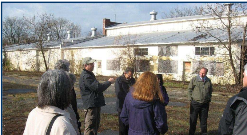
Discussing restoration priorities at the Propagation House Charrette

Propagation House Charrette: A preservation plan for the Propagation House is currently being prepared by Watson & Henry (preservation architects and engineers), to identify the issues, needs and