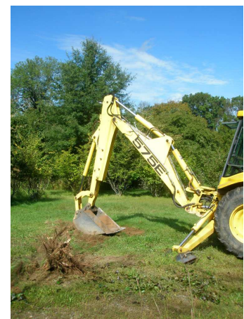
Stump removal in the Flemer Arboretum