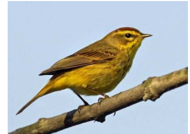
Palm Warbler