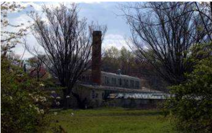
Propagation House

Restoration of the Propagation House: Significant funding ($290,000) has been released by the New Jersey State Legislature, allowing the first phase of the restoration of the Propagation House . These funds were obtained from a Garden State Preservation Trust Fund Capital Grant from the New