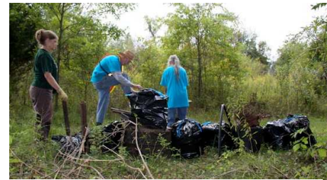
Volunteers on trash patrol

National Public Lands Day: On 9/25/09, Friends of Princeton Nursery Lands (FPNL), Kingston Greenways Association, and the D&R Canal State Park jointly sponsored a work party in the Nursery Lands for National Public Lands Day. It was a beautiful, breezy day to be at the Princeton Nurseries Kingston Site; wonderful weather for stewardship. We are very grateful to the 21 eager volunteers who participated in this event, including two children, who pitched in energetically!